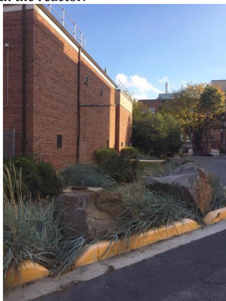
The garden on the backside of CHE.

A: After the 9/11 terrorist attacks, the garden was placed outside of the wall nearest the nuclear reactor. This served to prevent vehicles driven by terrorists from crashing into the wall and subsequently wreaking havoc with the reactor.