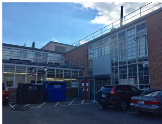
These windows span two floors, showing how it originally used to be one large connected room.

A: Right below this room, there used to be a radiation facility. To keep the radiation secure, the room is contained by "very very thick concrete walls" and a "two foot thick concrete ceiling," causing the room above to step up.